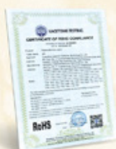
CERTIFICATE OF ROHS COMPLIANCE