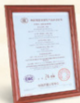
CERTIFICATE FOR CHINA COMPULSORY PRODUCT CERTIFICATION