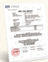
EMC TEST REPORT