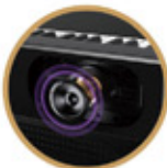
FRENCH DREAM MUSIC SOURCE