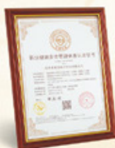
OCCUPATIONAL HEALTH AND SAFETY MANAGEMENT SYSTEM CERTIFICATION