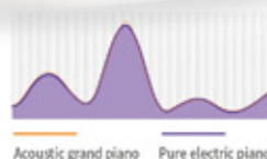
Acoustic grand piano Pure electric piano