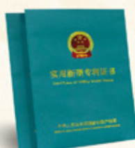
CERTIFICATE OF UTILITY MODEL PATENT