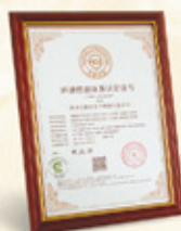
ENVIRONMENTAL MANAGEMENT SYSTEM CERTIFICATE