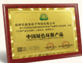
CHINA GREEN PRODUCTS