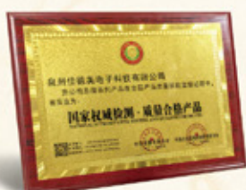
NATIONAL AUTHORITATIVE TESTING · QUALIFIED PRODUCTS