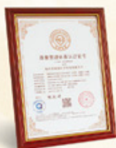
QUALITY MANAGEMENT SYSTEM CERTIFICATE