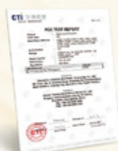
FCC TEST REPORT