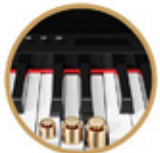
88 STANDARD HAMMER KEYBOARD